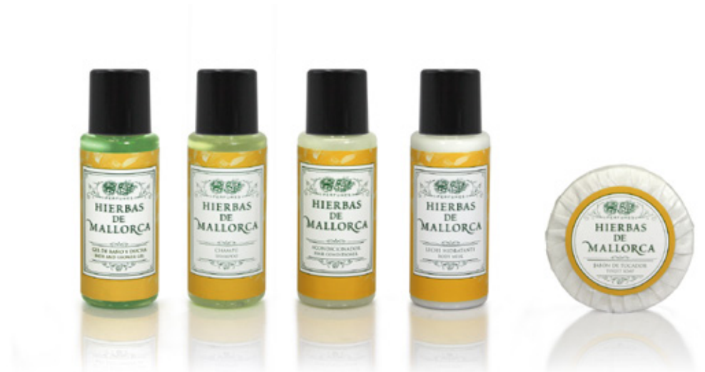
30 ml bottles