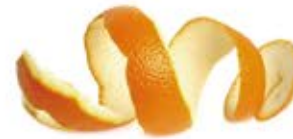
Lemon and Orange Peel

Every house in the island used to have it. We use the variety Barbadensis Miller, the one with a largest number of properties.